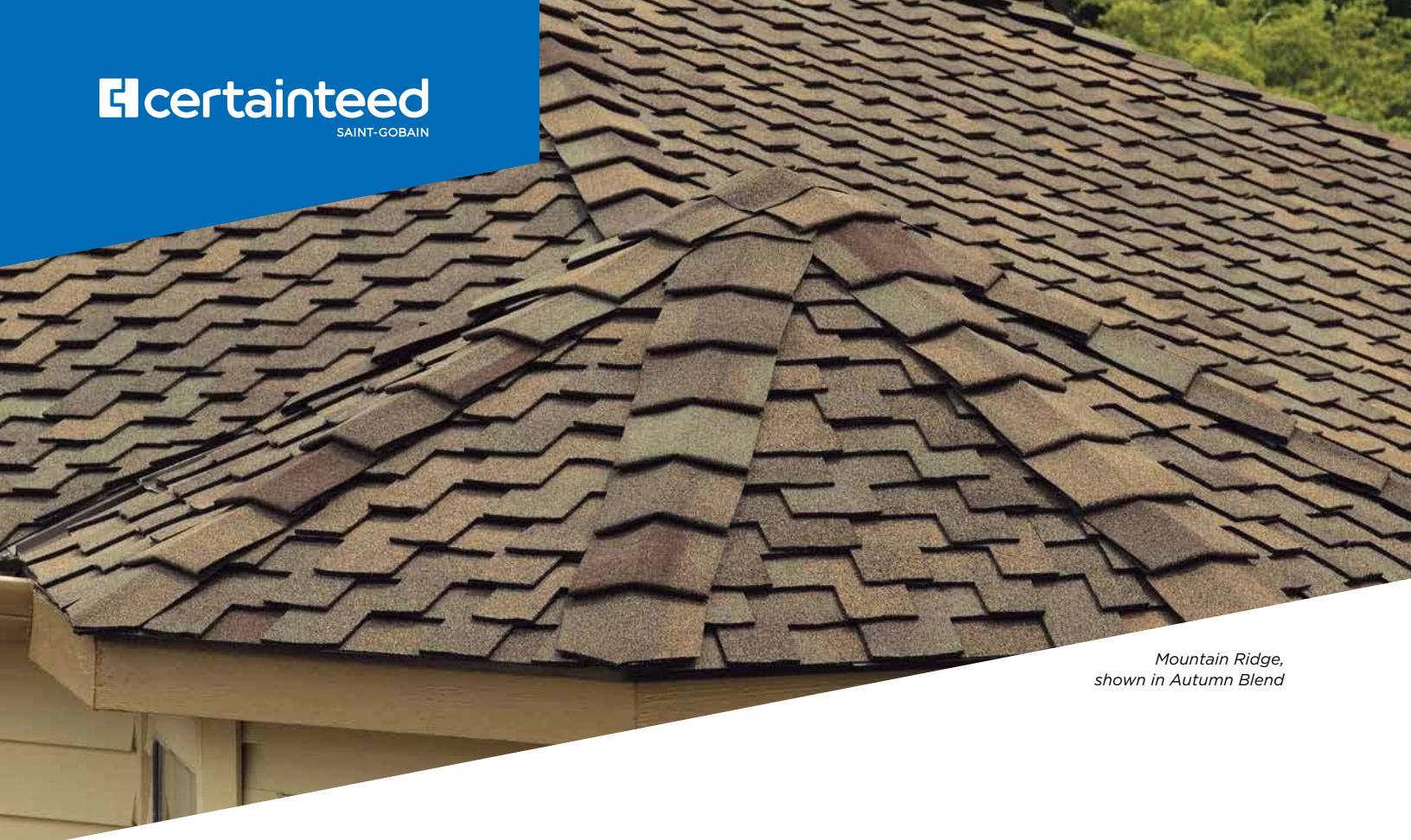
Mountain Ridge, shown in Autumn Blend